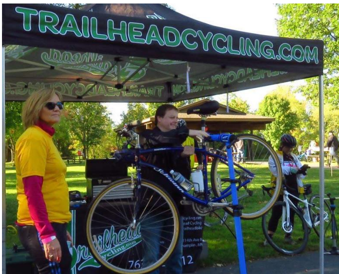
Mechanics were on hand for safety inspections and repairs.

It was a beautiful day in September for the annual B4k Legacy Ride. Forty-eight riders joined in this event held at Elm Creek Park Reserve in Maple Grove. The temperature was in the high 40s with a light breeze. The ride brought in over $6,500 that will be used to support operations. Pictures are worth more than words so here are some selected from the many that were sent in: