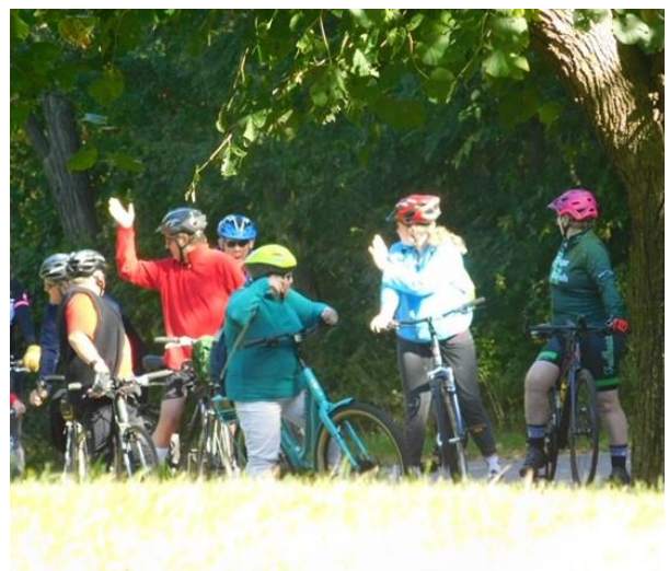
The end of a great day!