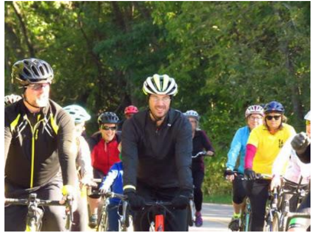
Just look at the smiles!